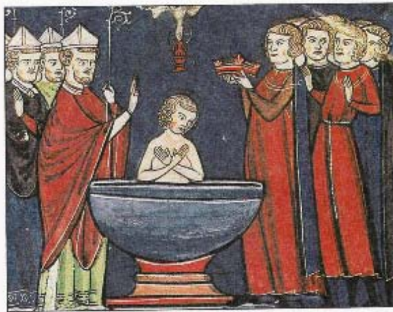
FIGURE 6.5 Baptism of Clovis.