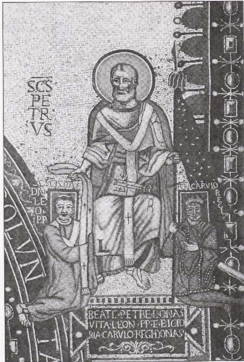
FIGURE 7.3 Saint Peter blessing Pope Leo and Charlemagne, ca. 798.