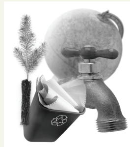
We can all take a part in making the environment a little cleaner.